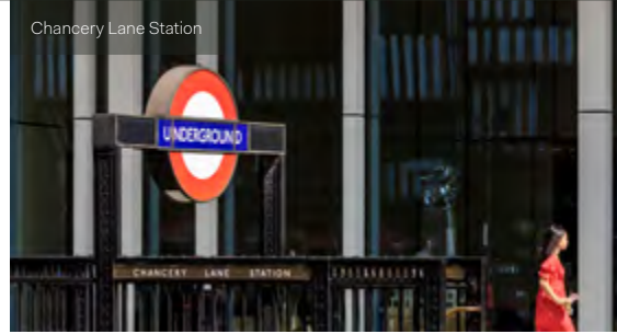
Chancery Lane Station