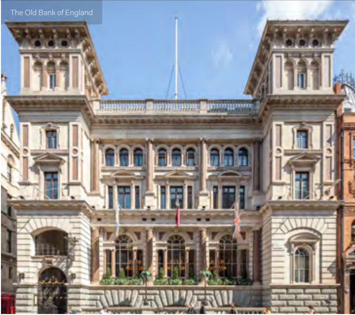
The Old Bank of England