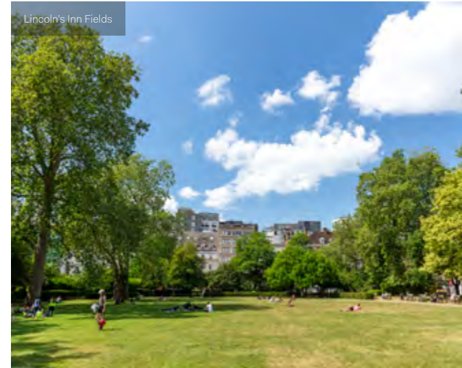
Lincoln's Inn Fields